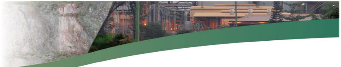
Figure 1 – Results Area