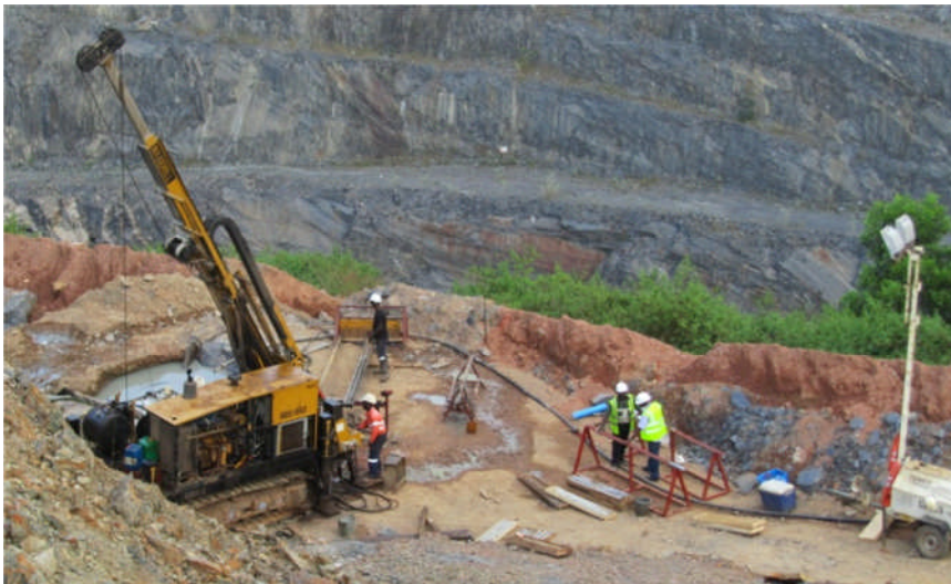
Drilling around the Bibiani Main Pit

Noble is currently conducting a significant drilling programme on the full length of the Bibiani Main Pit. This work will be collated and updated and in conjunction with the structural information gained in June used to re-assess the Bibiani resource, with a target date for the update to be completed in mid-2012.